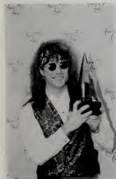
Jon Bon Jovi

The Kentucky HeadHunters were the epitome of southern gentlemen (in scruffy dress) and kept everyone laughing with their self-deprecating humor. ("We knew we had a chance at waddin' if men were voting. But if women were voting we didn't have a chance. Not against Alan Jackson and Travis Tritt. They're good-looking and talented. We're just talented.")