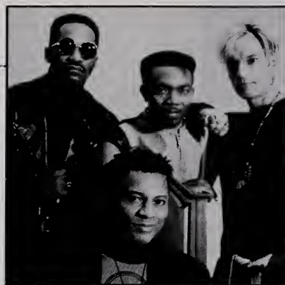
High Debut: London Beat #76