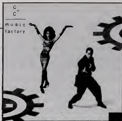
#1 Single: C&C Music Factory