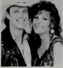
Ricky Van Shelton & Patty Loveless