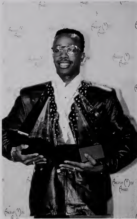
M.C. Hammer, proudly displaying five trophies, was the big winner at the 18th annual American Music Awards, a dick clark productions, inc. presentation which was televised over the ABC network on January 28. Hammer was named Favorite Male Soul/R&B Artist, Favorite Rap Artist, his "U Can't Touch This" was named Favorite Soul/R&B Single, and his Please Hammer Don't Hurt 'Em was named both Favorite Soul/R&B Album and Favorite Rap Album.