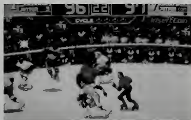
Screen Shot of RollerGames