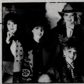
High Debut: Forester Sisters #43