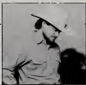
#1 Single: Paul Overstreet