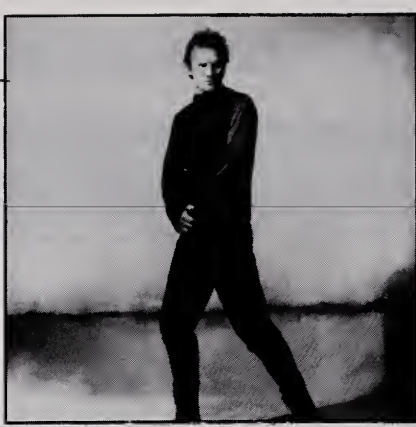
High Debut: Sting #13

(G) = GOLD (RIAA) Certified (P) = PLATINUM (RIAA) Certified