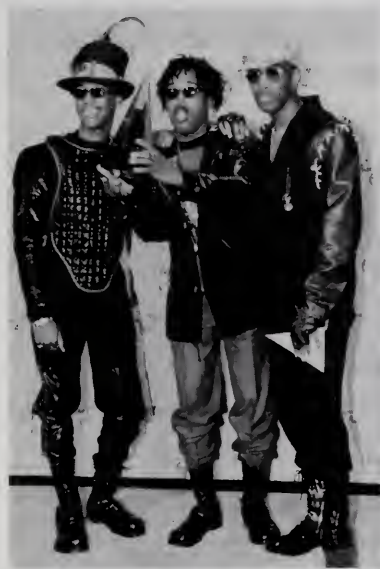
Tony! Toni! Tone!

In the rap category, Digital Underground, Too Short and Candyman walked home empty-handed, losing out to Hammer and Vanilla Ice. Tony! Toni! Tone! were named Favorite Soul/Rhythm & Blues Group. The audience was certainly one of the most vocal in the history of the show. Even those people who weren't fans of New Kids on the Block had to feel for them as they were booed when introduced by the show's host, Keenan Ivory Wayans. Cheers turned to boos for Madonna when Chubby Checker announced she couldn't attend the show