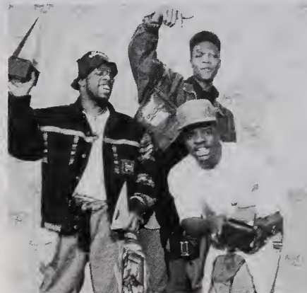
Bell Biv DeVoe show off the two trophies they received when they were named Favorite New Artist in both the Soul/R&B and Dance Music categories.