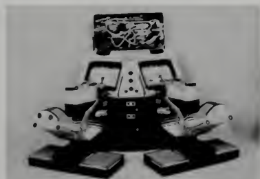
Sega GP Rider (Ride-on)

Further information may be obtained through factory distributors or by contacting Sega Enterprises, Inc. (U.S.A.), 2149 Paragon Drive, P.O. Box 610550, San Jose, CA 95161-0550.