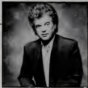
To Watch: Conway Twitty #15