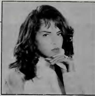
#1 Single: Pebbles