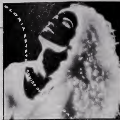
To Watch: Gloria Estefan #26