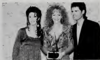
Tiffany, Reba McEntire, Donny Osmond

Hard rock and heavy metal artists fared well both inside and outside of the heavy metal/hard rock category. Aerosmith won the award for favorite band, duo or group in the pop/rock category—defeating Bell Biv DeVoe and New Kids On The Block—and defeated Motley Crue and Poison in the contest for favorite heavy metal/hard rock artist. However, Aerosmith's Pump and Poison's Flesh and Blood were defeated by Motley Crue's Dr. Feelgood in the race for favorite heavy metal/hard rock album. The award for favorite new heavy metal/hard rock artist went to Slaughter, who was competing with Bruce Dickenson and Don Dokken.