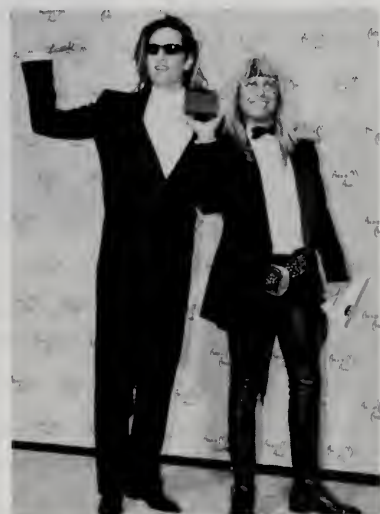
Motley Crue's Tommy Lee, Vince Neil

The red hot trio, Bell Biv DeVoe, confirmed that there are still plans for New Edition to get back together, but with Ralph Tresvant's album just being released, Bobby Brown about to release the follow-up to his enormous-