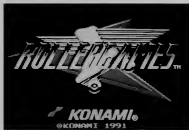
Screen Shot of RollerGames

Further information may be obtained through factory distributors or by contacting Konami, Inc., 900 Deerfield Parkway, Buffalo Grove, IL 60089-4510.