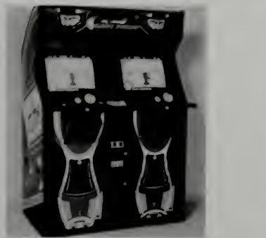
Sega GP Rider (Upright)