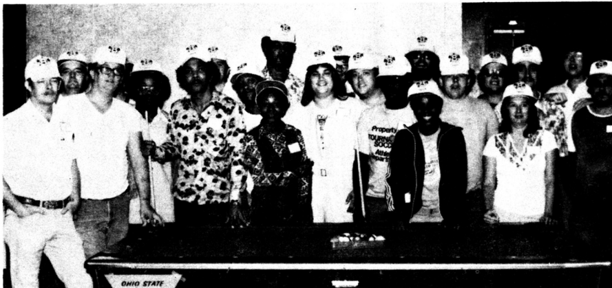
Ohio Tournament referees