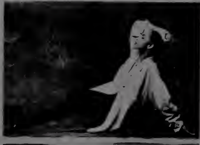
Sade — Promise — Epic