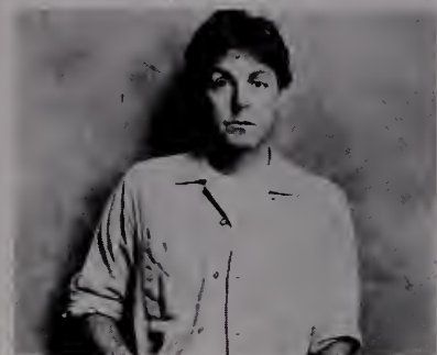
Paul McCartney — Spies Like Us — Capitol