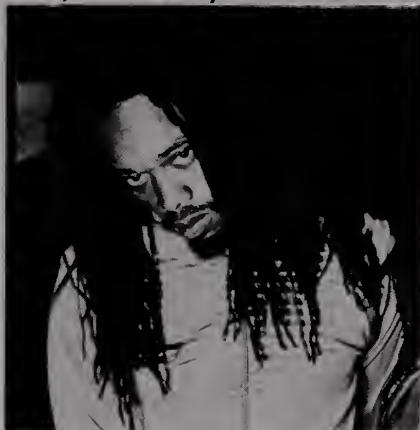
SOLO ROSE — Former Black Uhuru lead vocalist Michael Rose will be doing solo dates at the Music Machine and the Golden Bear early this month.

THE PHANTOM BAND — EMI America's Phantom, Rocker and Slick , the famed knock-off from the once commercially dominating Stray Cats , is enjoying a measure of success with its self-titled debut, though the LP's first single "Men Without Shame" stalled out of the pop singles chart and the record is hovering in the '70s on the LP chart. Recently performing shows opening for INXS on the west coast, the band has been under some heat for its tepid live show and songwriting, yet the group seems to have the right components. Drummer Slim Jim Phantom and bassist Lee Rocker are a steady rhythm section and guitarist Earl Slick ( David Bowie, John Waite ) is a classic rock guitarist, yet songs seem to be the