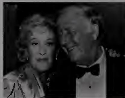
GRAND PIANISTS — George Shearing (r) was one of the pianists who joined Marian McPartland at a reception to celebrate the presentation of tapes of Piano Jazz, McPartland's award winning radio series, to the N.Y. Public Library's Rodgers and Hammerstein Archives of Recorded Sound.