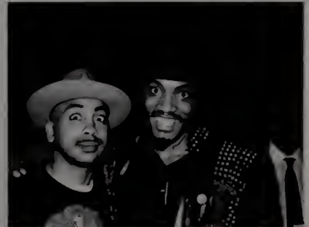
IN VIEW AT VISAGE — It was an all-star turnout at Norby Walters' recent bash at New York's Visage Club, where Coati-mundi, (l) from Kid Creole & The Cocanuts, met up with Melle Mel (r).