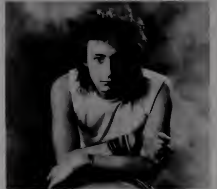
LENNON ON VIDEO — Atlantic recording artist Julian Lennon makes his home video debut on MCA Home Video in Stand By Me: A Portrait Of Julian Lennon , an hour long tape retailing for $29.95.