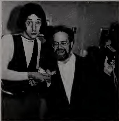
PAY FOR PLAY? — Dr. Demento (r) came by to interview Emo Phillips after his recent, sold out performance at the Roxy in Los Angeles.