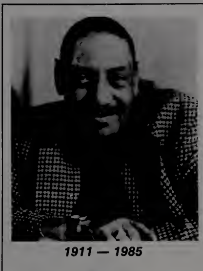
1911 — 1985

Big Joe Turner will definitely be missed.