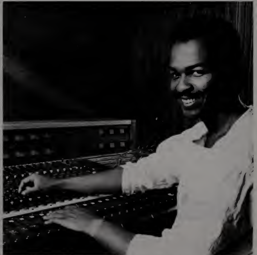
PARKER JR. USES SONY — Ray Parker Jr. and his Amerycan studios in North Hollywood, California are in high demand these days, with artists such as Kenny Rogers, Lionel Richie and Philip Bailey being some of his clients. Parker's choice of equipment includes the Sony JH-636 console, JH-24 multitrack recorder, JH-110-4 four-track recorder and JH-110-2 stereo mastering recorder . He has also used his Amerycan facility to record his latest Arista release "Sex and the Single Man."