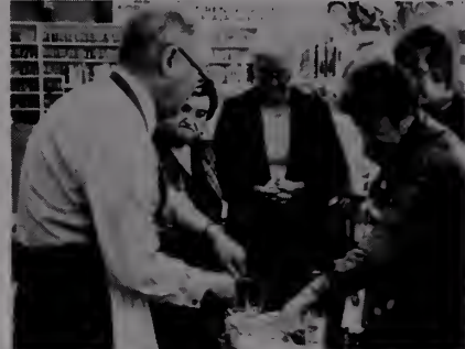
TASTY VIDEO — Craig Claiborne, world famous cooking expert, prepared a dish for enthusiastic fans at a recent appearance at Video Shack's Carle Place Long Island store. Claiborne's new video cassette Craig Claiborne's New York Times Video Cookbook includes the recipe he prepared and many more.