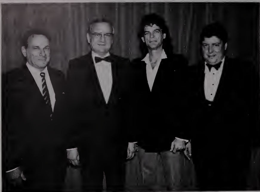
LIBERTY IS THEIR LADY — Lee Iacocca, chairman of Chrysler Motors, Inc. and chairman of the Statue of Liberty/Ellis Island Foundation is pictured (second from l) congratulating ASCAP president Hal David (l) and Joe Raposo (r) whose song "America Is," is the official song for the Statue of Liberty restoration campaign. The song was recorded by B.J. Thomas (second from r) and is featured on Thomas' current LP "Throwing Rocks at the Moon" on CBS. "America Is" will be released shortly as a single.