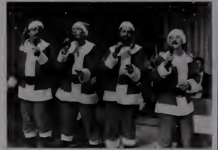
The Statlers spread a little Christmas cheer.