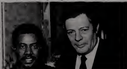
A SPECIAL DAY — Marcello Mastroianni (l) came by to wish Wayne Shorter well, after catching one of the saxophonist's sets during his recent week-long stint at N.Y.'s Blue Note.

"It's on the back burner," says Shorter of Weather Report, which he co-led with Joe Zawinul, "it is in the closet. Like Natalie Wood and Robert Wagner, when they first separated and some six years went by and they got married again. You never know. Weather Report could do something again in the future, but right now I feel that people will be getting the best of Weather Report from two individ-