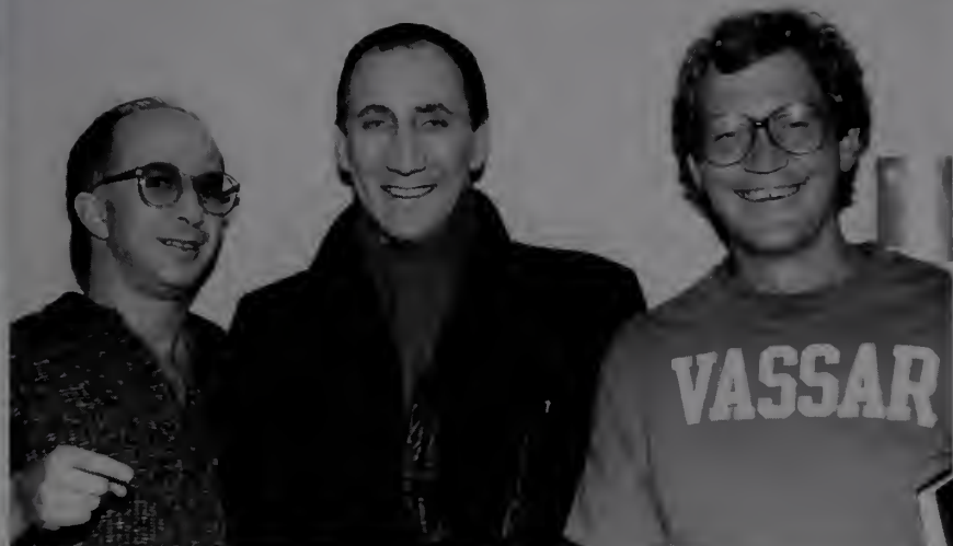
CHWHOING THE FAT — Former Who guitarist and Atco recording artist Pete Townshend recently spent a week in New York City doing an extensive series of media interviews. Townshend's visit coincided with the release of his new solo album, "White City-A Novel." Among Townshend's appearances in New York was an interview on NBC-TV's Late Night With David Letterman. Pictured (l-r): relaxing following the taping of the show are, Paul Shaffer, Letterman's musical director, Townshend and David Letterman.