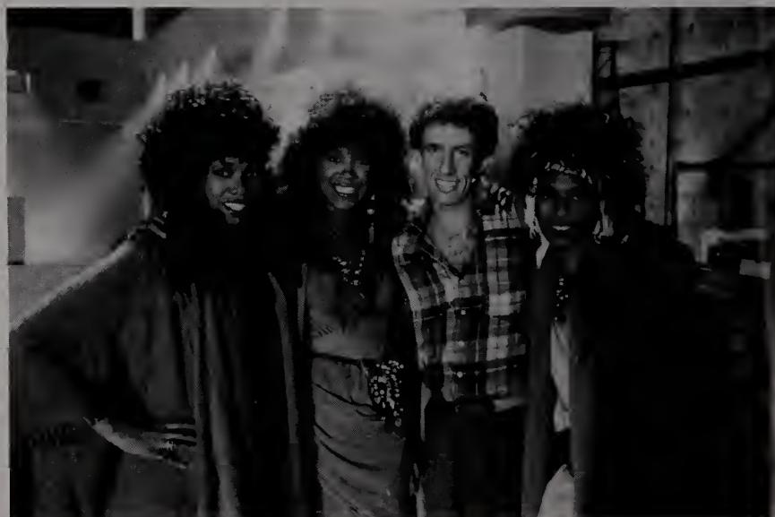
A FEW POINTERS FOR PERRY — During the shoot for RCA recording artist the Pointer Sisters new video, Freedom, producer Richard Perry and the sisters took time out to pose for the still camera. Perry co-directed the video, which features a $30,000 set and black and white photos of freedom fighters Martin Luther King, Abraham Lincoln and Bishop Tutu, among others. Pictured (l-r) are: Anita Pointer; Ruth Pointer; Perry; and June Pointer.

Comments: "This song was great before and the updated version is even better. Good clean fun in the sun. A nice video."