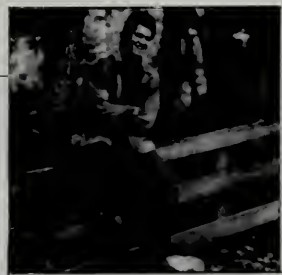
#1 Single: Randy Travis