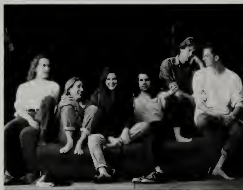
Edie Brickell & New Bohemians