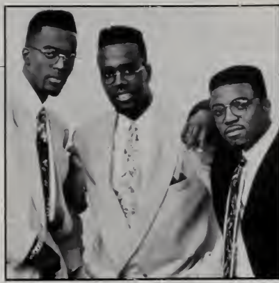
#1 Single: Guy