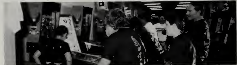
This photo depicts some of the numerous conventioners who participated in the Bally Harley-Davidson pinball tournament.