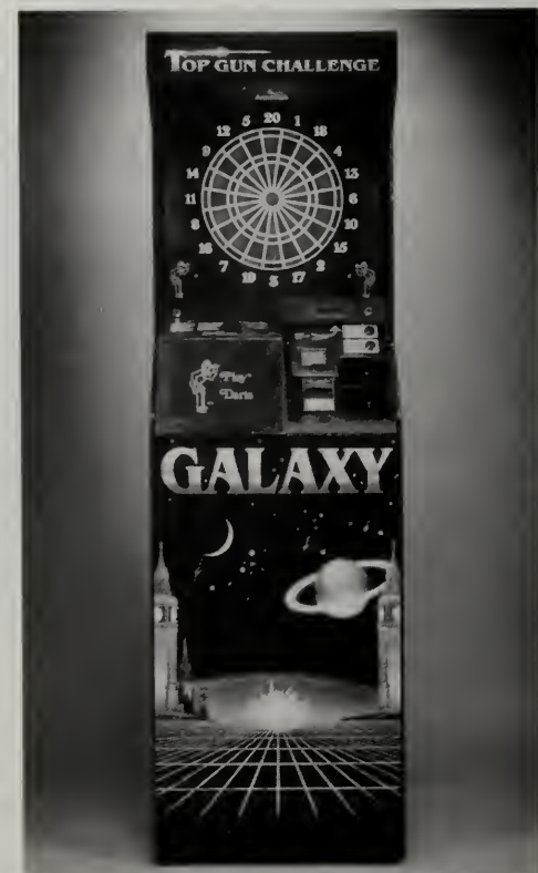
English Mark Darts Galaxy

Further information regarding the numerous advantages and time-saving aspects of the Galaxy concept may be obtained by contacting Arachnid, Inc. at 6421 Material Ave., P.O. Box 2901, Rockford, IL 61132-2901.