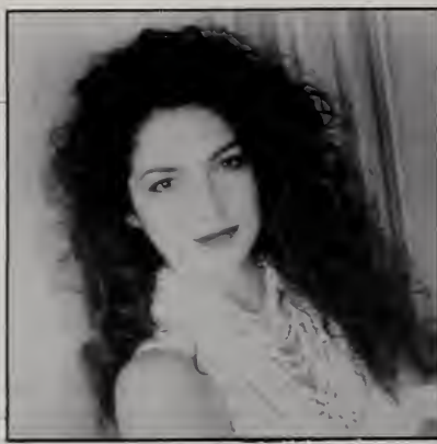
#1 Single: Gloria Estefan