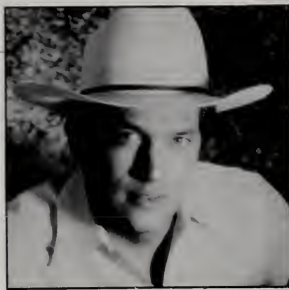
High Debut: George Strait #141

(G) = GOLD (RIAA) Certified (P) = PLATINUM (RIAA) Certified