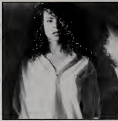
High Debut: Mariah Carey #51