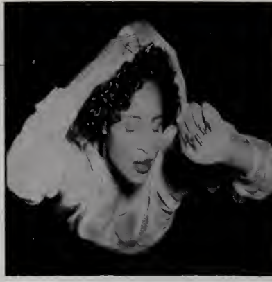
High Debut: Innocence #68