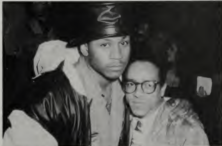
PLATINUM COATED LABEL-MATES: L.L. Cool J (left) and Freedom Williams (of C&C Music Factory) take a break during Urban Network's Power Jam II conference in Los Angeles.