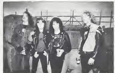
METAL'S FINEST —Elektra's Metallica bring their uncompromising brand of bone-crunching metal to the Felt Forum August 20.

Do For Me," sounding as fresh and flexible as Prince circa "Lady Cab Driver." By set's end people were still requesting songs. She asked the audience whether they wanted "Love Of A Lifetime" or "Ain't Nobody" and the crowd chose the latter. Chaka played it to its anthemic hilt, offsetting the funk with rock abrasiveness. Two encores later, people were still up and dancing to a quiet storm that had turned into a veritable electrical thunderstorm.