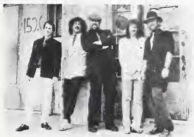
BUSTING OUT —L.A.'s The Bluesbusters come to Club Lingerie August 23.

ANKA WON'T RUN —Yeah, so there's an actor in the White House and he happens to be from California, but is this state turning into the land of the show biz candidate, or what? Well, in case you were stressing out over the issue, Points West now answers the burning question, "Will Paul Anka run for mayor?" The Monterey resident has conclusively nixed the rumor, which his publicists say got its start in Liz Smith's column for the New York Daily News. "I shall not run for office," the songwriter officiously states, "and if elected, I shall not serve." Meanwhile, a source at Monterey City Hall said she never even knew he was asked. Apparently, the rumor mills have been working overtime, and Anka says he's "flattered" at the notion, but he isn't politically inclined. "Besides," he further explains, "if ( Clint Eastwood ) is having trouble with the Carmel City Council, a simple, 'Go ahead . . . make my day' will keep them in tow. I doubt a stern chorus of 'Put Your Head On My Shoulder' would accomplish the same thing." Nevertheless, he will perform for that other California show biz politico at a White House state dinner September 18.