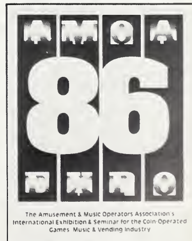
The Amusement & Music Operators Association's International Exhibition & Seminar for the Coin-Operated Games, Music & Vending Industry