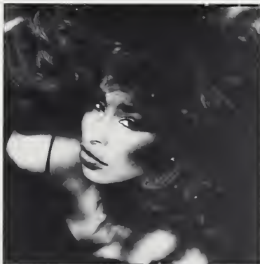
KHAN SHE EVER! —Chaka Khan sizzled on Pier 84 August 8, playing material from Rufus oldies to recent "Destiny" (Warner Bros.) tunes.

THUNDERSTORM — Chaka Khan's "Destiny" (Warner Bros.) struck me as an ace album by a funk-popster with a weak spot for the quiet storm. But in concert (Pier 84, 8/8), Khan came off like a funk-popster with a weak spot for the rock 'n' roll power chord. Sure, there were moments when Chaka crooned through the eye of a quiet storm with an aplomb that would have made Luther Vandross proud, but this show more often crossed the line into rock. Backed by an eight-piece band that included a guitarist who knows the ins and outs of arena-distortion, Chaka played a smattering of her best known songs in a tight ninety-minute show. She even dusted off a couple of Rufus chestnuts like "Tell Me Something Good," ironing out its choppy structure into something more flowing. She was at her best on uptempo funk like "Destiny" and "What You Gonna