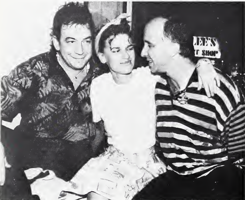
YOU ANIMAL! —Ex-Animal Eric Burdon was a recent guest on NBC Radio's The Paul Shaffer Show Live At The Hard Rock Cafe . Burdon is promoting his upcoming Faber and Faber book I Used To Be An Animal, But I'm Alright Now . Pictured (l-r) Burdon , Sandra Bernhard , Shaffer .