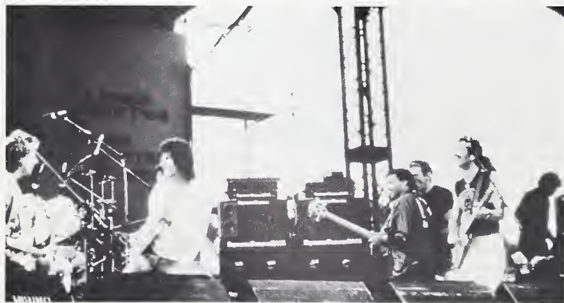
TRIPLE JAM IN JAPAN —Jeff Beck and Carlos Santana recently appeared at a special concert event, in Karuizawa in Japan. As a part of the finale, the two guitarists were joined on stage by Steve Lukather of Toto for the show's closing number, "Johnny B Goode." Pictured are (l to r): guitarists Steve Lukather, Jeff Beck, and Carlos Santana.