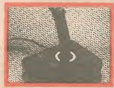
The Gravis Analog

JOYSTICKS? Do you want to know where you can stick yer RUDDY iovsticks?