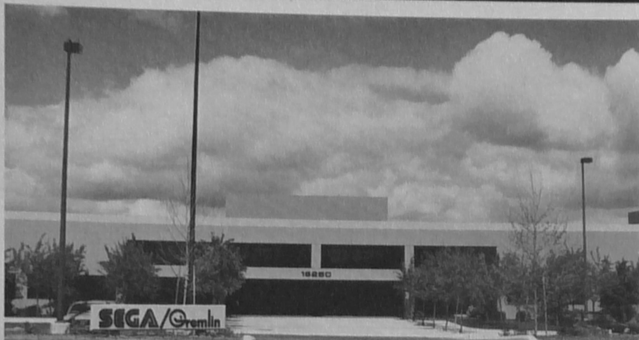
Home of Sega/Gremlin Industries.