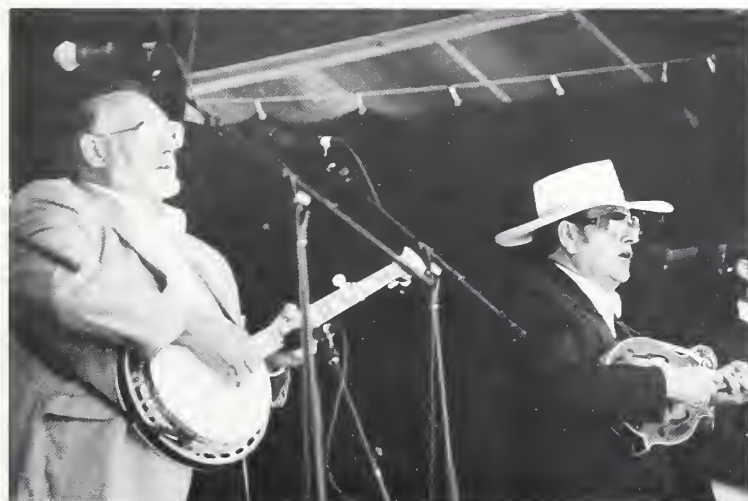
Bluegrass/country legends The Osborne Brothers (of "Rocky Top" fame) were first-timers at Telluride. Brothers Sonny (l) and Bobby (r) were treated to standing ovations from the crowd of thousands.