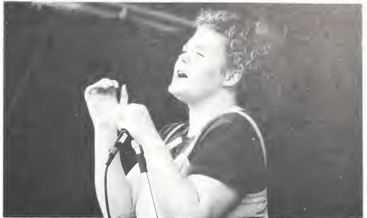
Irish folk singer Maura O'Connell drew raves from "festivarians" with her blend of bluegrass, blues and folk music.