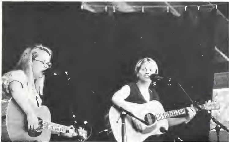
Mary Chapin Carpenter (l) was a surprise guest at this year's Telluride show. Carpenter joined buddy Shawn Colvin onstage to perform some of Colvin's new material.