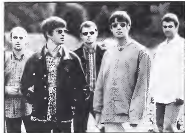
High Debut: Oasis