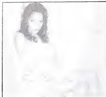
This Week's #1: Toni Braxton