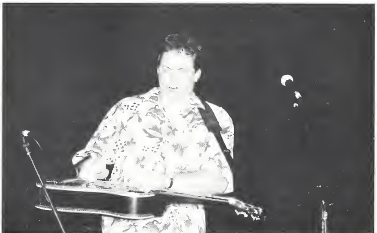
Another popular summer show is the Doyle Lawson & Quicksilver's Family Style Bluegrass Festival held in Denton, North Carolina. The annual event drew hundreds of fanatics who enjoyed the music of bluegrass' finest, including dobro master Jerry Douglas.