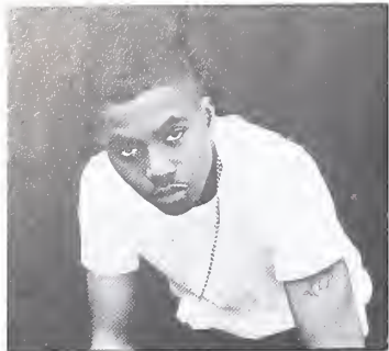
This Week's #1: Nas