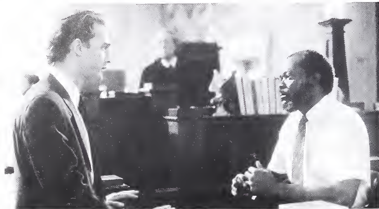
Matthew McConaughey puts client Samuel L. Jackson on the stand for a hot moment.

THERE'S A BIG BUZZ goin' 'round regarding A Time To Kill . It's not necessarily about the film though and it's definitely a manufactured buzz. The majority of the excitement is concerned with the initiation of Matthew McConaughey into the rarefied retail realm of Hunkdom. For a month now you haven't been able to get away from it: covers on newsstands; TV tabloids; radio talks. The McConaughey Hunk's got one helluva machine behind him.