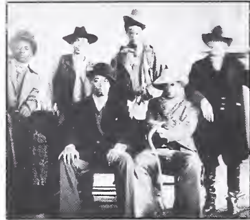
High Debut: Sadat X