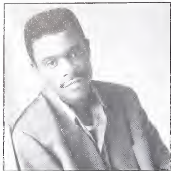
This Week's #1 Keith Sweat