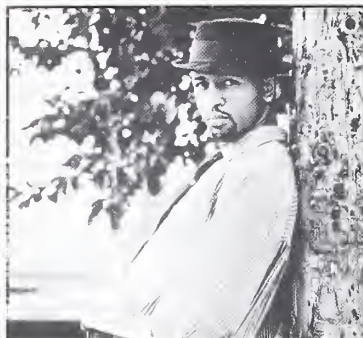
High Debut: The Tony Rich Project