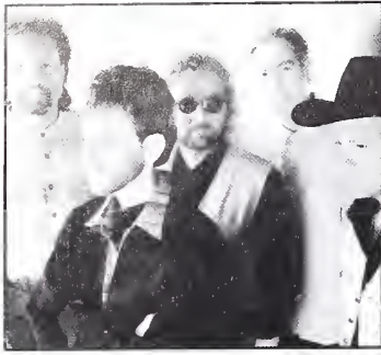
This Week's #1: Sawyer Brown