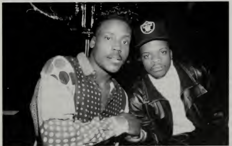
Backstage at Ready For The World video shoot at the Palladium in Hollywood, California are group member, Melvin Riley, and close friend, Ricky Bell of Bell Biv DeVoe.

GET THIS!... Rob and Fab (ex-Milli Vanilli members) got $200,000 for filming a Care Free gum commercial imitating opera singers... Terry Lewis of the famous producing/writing team "Jimmy Jam + Terry Lewis" has said "I do" to Warner Bros. recording artist Karyn White... Here is an interesting combination—Tone-Loc and El DeBarge, yes, you heard it right. The two have teamed up for a recording that has the inside industry buzzing.