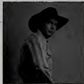
To Watch: Garth Brooks #18