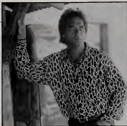
High Debut: Huey Lewis #46

(G) = GOLD (RIAA) Certified (P) = PLATINUM (RIAA) Certified