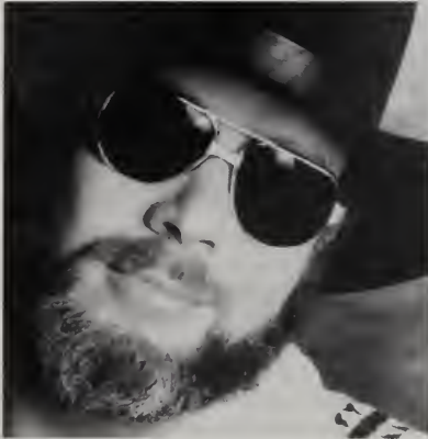
Hank Williams, Jr.