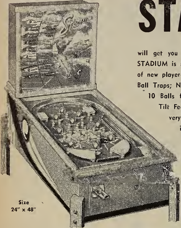
Size 24" x 48"

will get you many new locations because STADIUM is really a new game with loads of new player-appeal features; New Scoring Ball Traps; New Sequence Scoring Feature; 10 Balls for 5 Cents; New Advancing Tilt Feature; all incorporated in one very fast game that is beautiful in design and color, and earns big money.