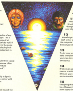
Steps to attack come from the map programming team that brought us Whodunnit.

Statals and building weapons can sometimes increase your tech level and reveal an element which could lead to the designs you require.