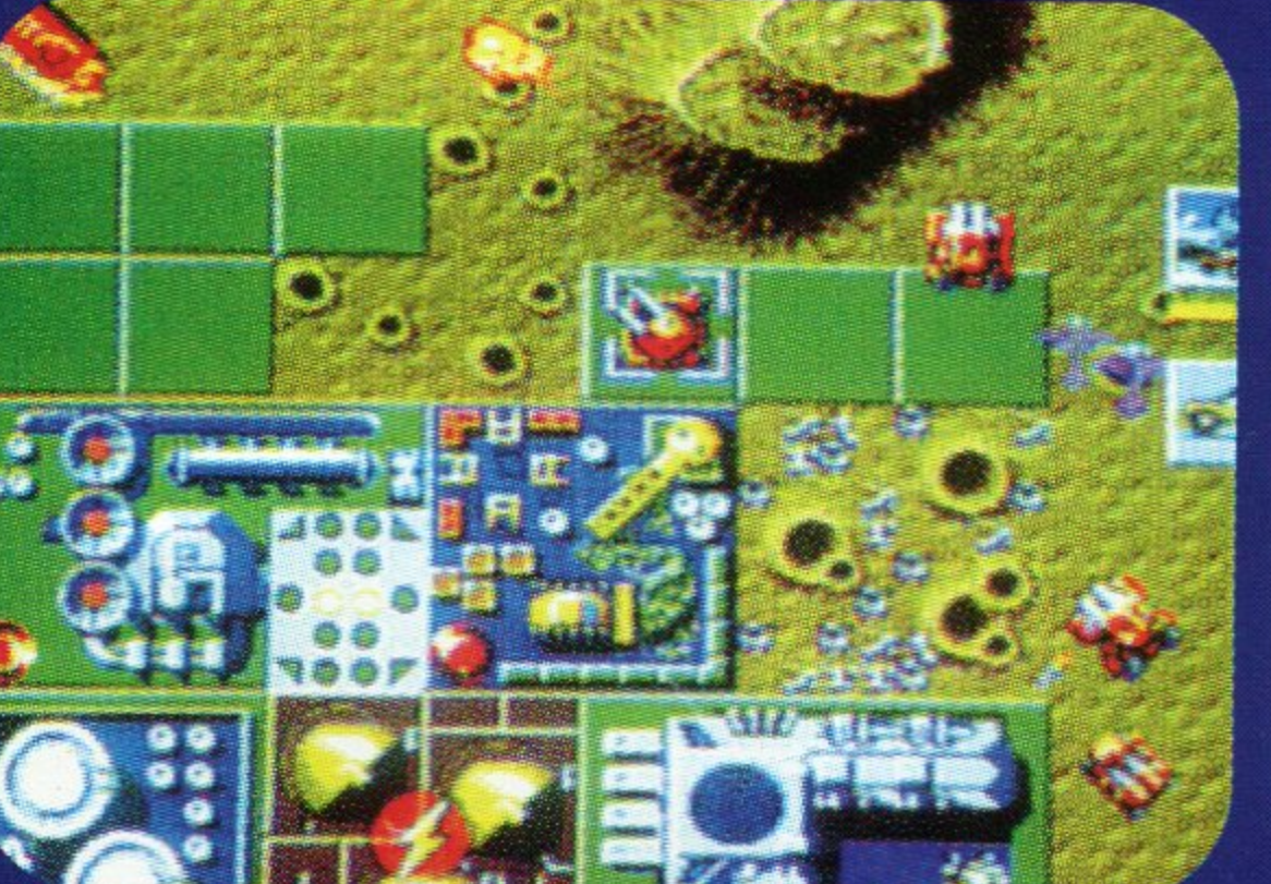
Defending your base is a lot easier with missile turrets.

Overall : A very well polished game. The puzzle elements are excellent and the gameplay is exciting.