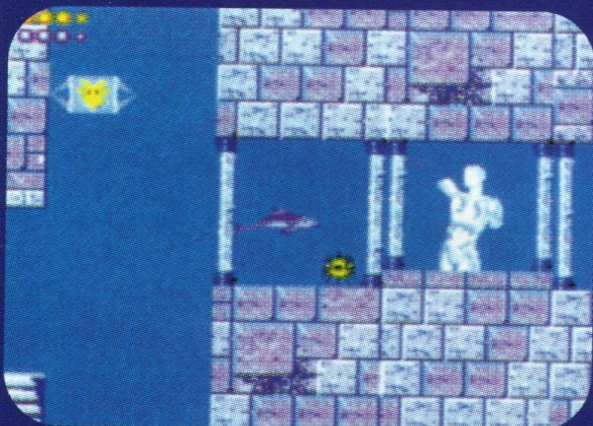
Ecco meets the man from Atlantis, well a statue of him anyway.