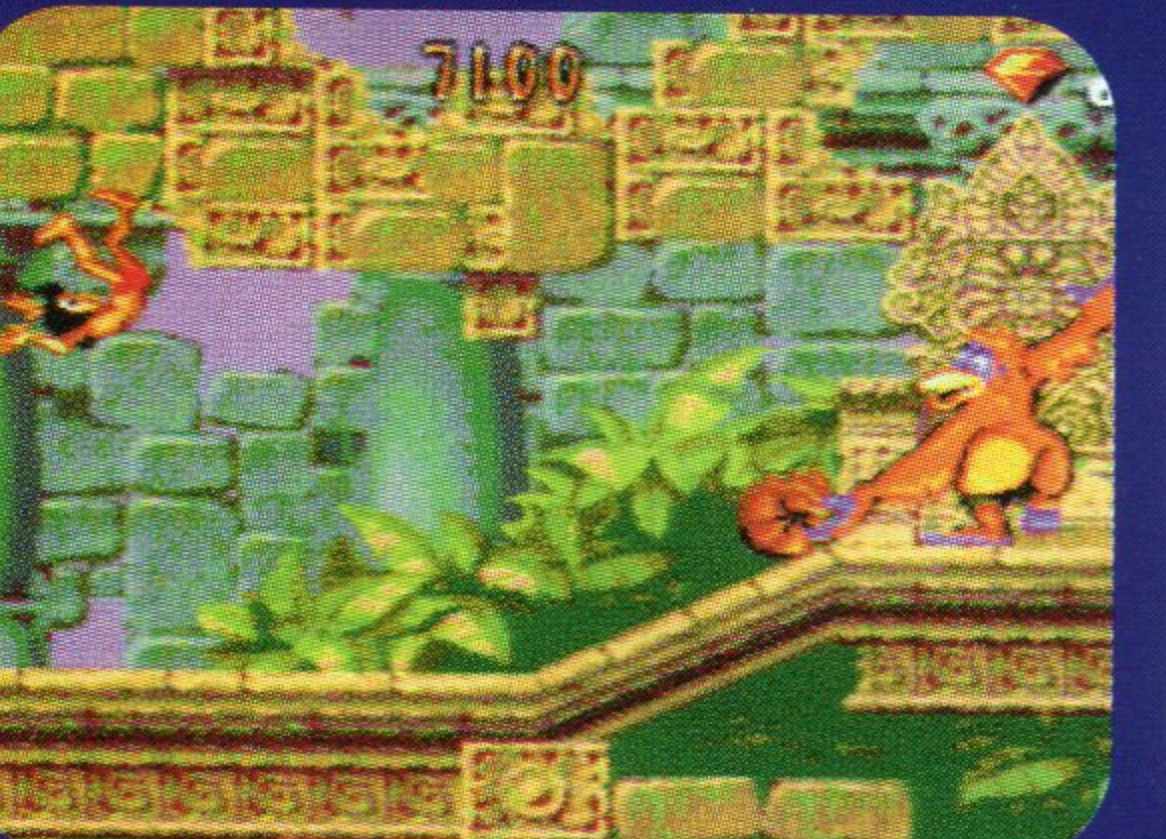
Louie needs one more Mowgli for a spare.

Overall: The best game to be released on Master System for a long time.