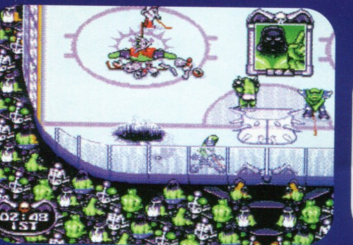
A penalty is given for excessive violence, the victim is swept off the ice.

Overall : Brilliant platform action that the whole family can enjoy.