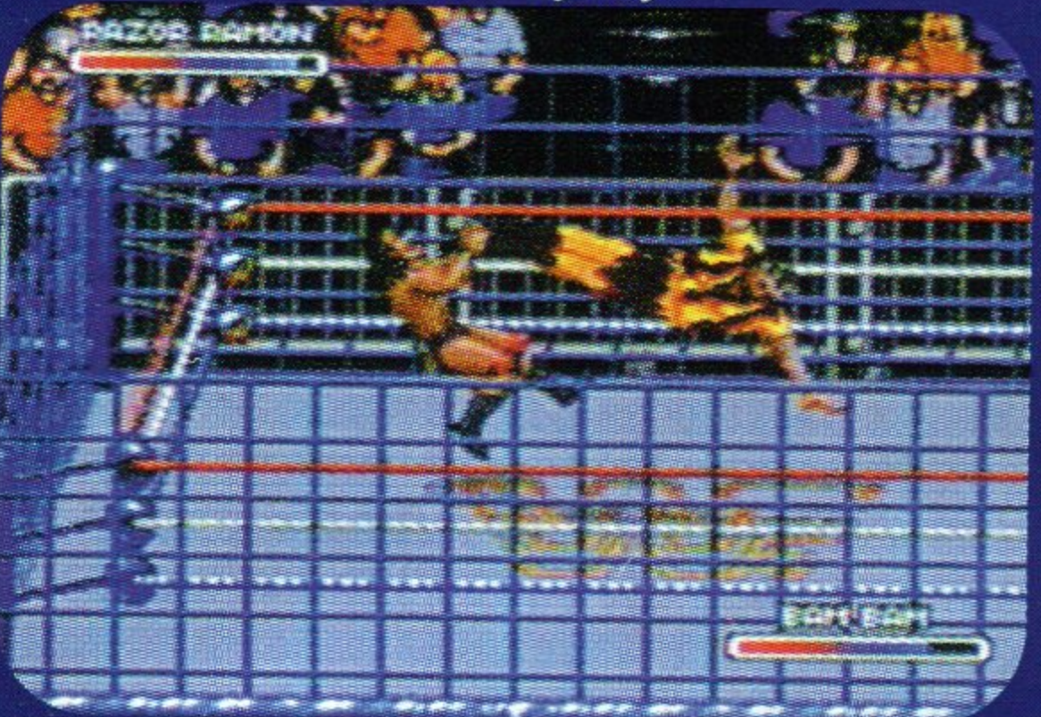
Bam Bam Bigelow and Razor Ramon rage in the cage.

Overall: The conversion of Ecco to the Master System is very impressive and has to be seen to be believed, but the most pleasing thing about it is the new puzzle elements found only on this version.