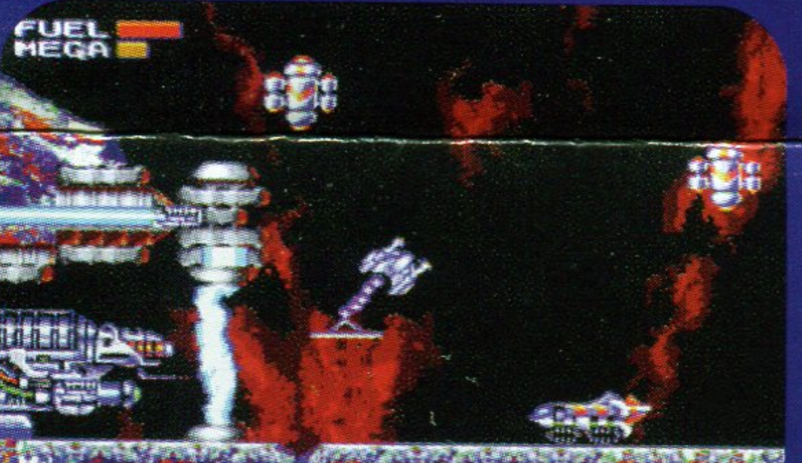
It appears the aliens are a little more prepared than you. Your tiny ship vs their big laser.

Overall: Not to be missed for two players. Excellent gameplay.