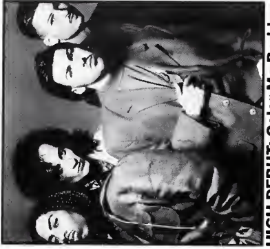
HIGH DEBUT: Color Me Badd #32