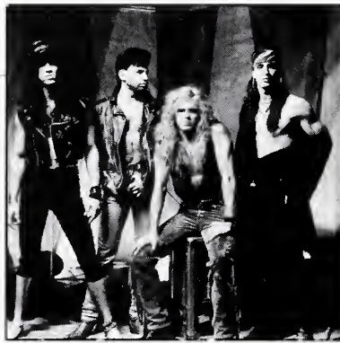
HIGH DEBUT: Extreme #58