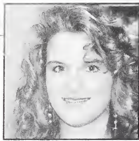
#1 SINGLE: Trisha Yearwood