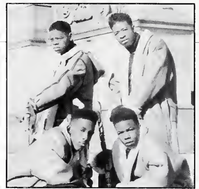
TO WATCH: Boyz II Men #57