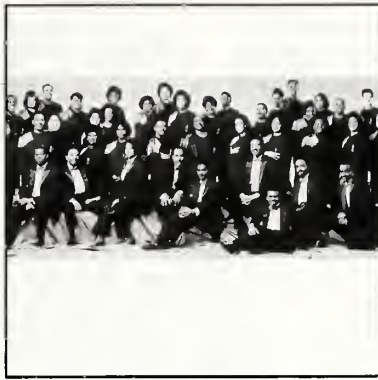
#1 SINGLE: The Sounds of Blackness