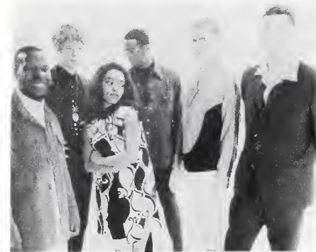
The Brand New Heavies

CASH BOX ARTIST PROFILE: Ever since the age of the techno-sound, many people have been praying for something new and real to come along and sweep everyone off their feet. Well, it seems that group is here and they call themselves The Brand New Heavies.