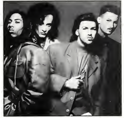
TO WATCH: Color Me Badd #34