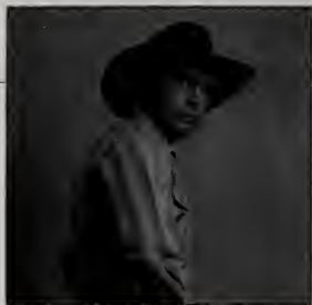
High Debut: Garth Brooks #44