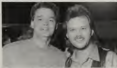
Doug Stone & Travis Tritt

MARK COLLIE PERFORMANCE BENEFITS "SPECIAL" SCHOOL —MCA Records recording artist Mark Collie recently performed in a special outdoor concert to benefit the Willow Hall School, a private facility which meets the special needs of children with learning disabilities, located in Franklin, Tennessee. Collie continues to ride a wave of phenomenal success with his debut album, Hardin County Line , which features his most recent single entitled "Let Her Go." Most recently, Collie returned to the studio to complete his second MCA project entitled Thunder Road , which is set for release this summer.