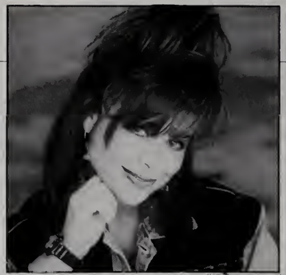
To Watch: Paula Abdul #25