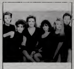
#1 Indie: The Hollanders #38