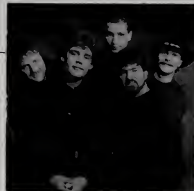
To Watch: Shenandoah #36