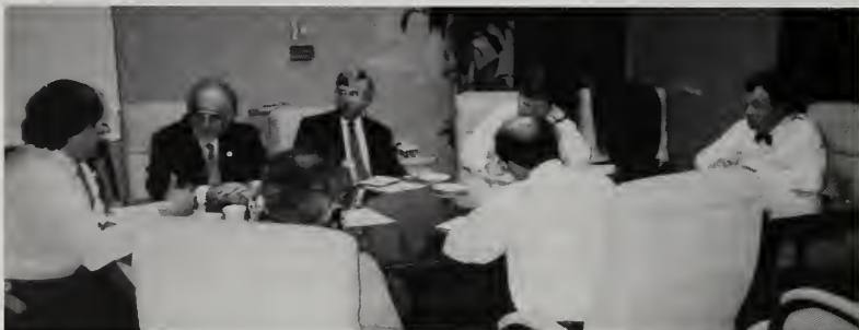
The Williams Bally/Midway Distributor Advisory Board will be meeting on a regular basis throughout the year with membership rotated from among the company's entire distributor network.