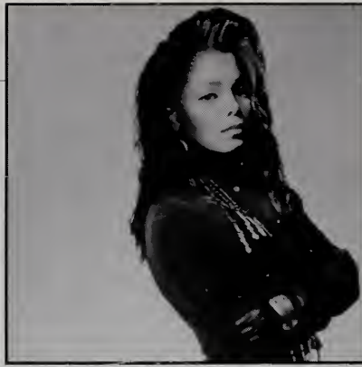
High Debut: Janet Jackson #53