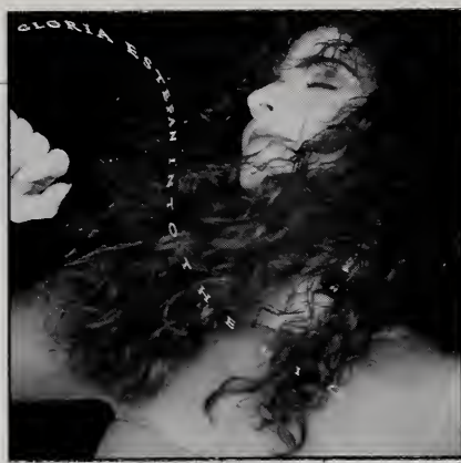
High Debut: Gloria Estefan #39

(G) = GOLD (RIAA) Certified (P) = PLATINUM (RIAA) Certified