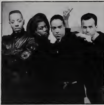
#1 Single: C&C Music Factory