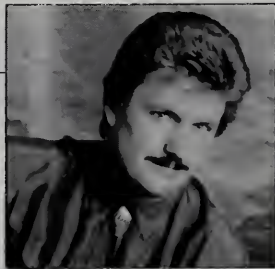
#1 Single: Joe Diffie