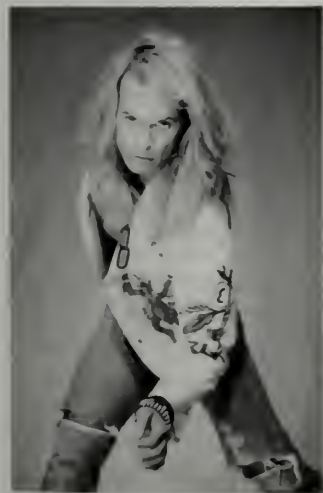
David Lee Roth