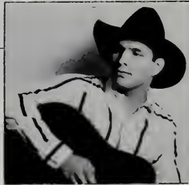
High Debut: Garth Brooks #30