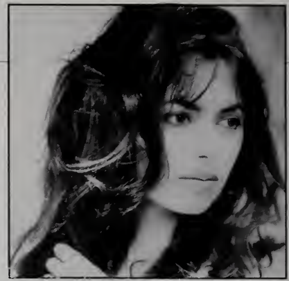
To Watch: Susanna Hoffs